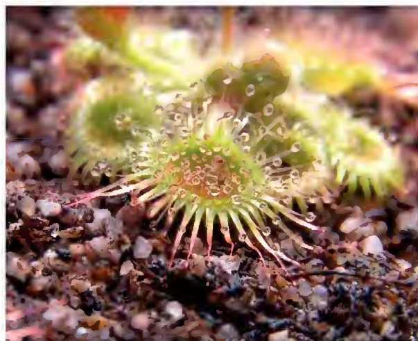
Figure 2: Drosera glanduligera with just flung fruit fly.